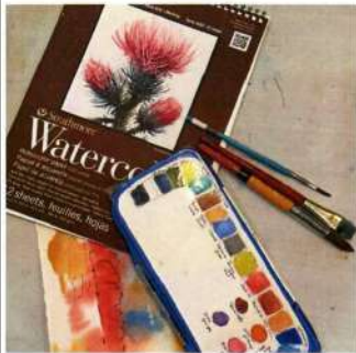
CLASS TAUGHT BY JULIE MERRILL