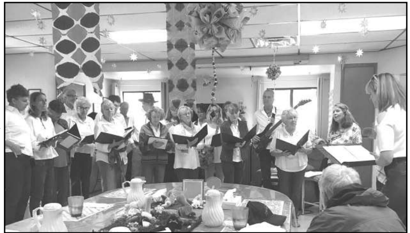
Oak Tree House participants enjoying a live performance by the “Rockin’it Old School” seniors chorus.